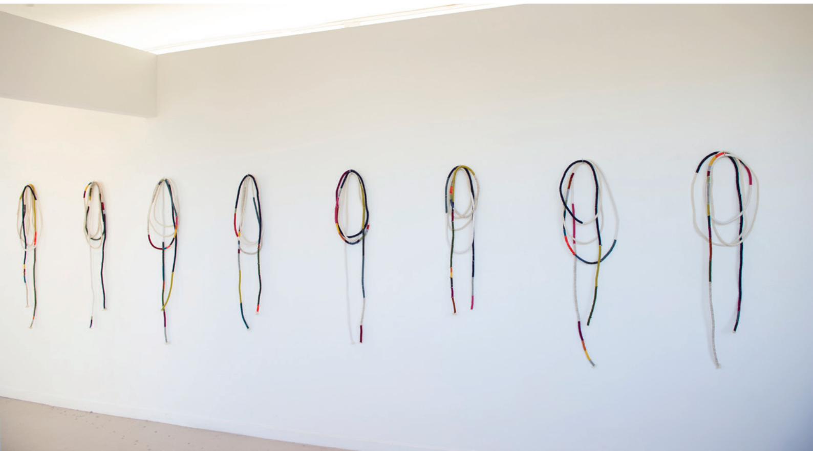
Image: Sabrina Baker, May-December , 2015, wool and rope, dimensions variable